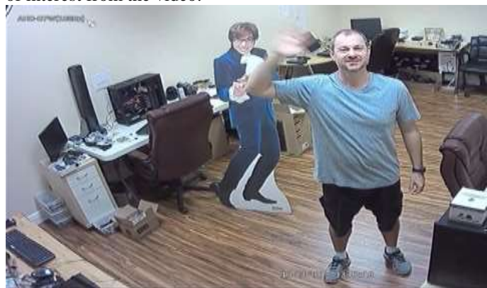
Figure 1:Extracted frame from the video sequence.

Given Z_t , the tracking of foreground objects is assumed to be possible. At each time index, a zero-skew affine warp parameter p_t can be estimated that maps coordinates in an object template image, T, to their corresponding in Z_t . Markov dynamical system is governing the time evolution of p_t . By using p_t we can calculate the position of the tracked object's bounding box using the markov's equations. The area of the bounding box specifies the number of foreground components. The formula for the area of a polygon from its corner coordinates is used for tracking the foreground object of interest from the video.